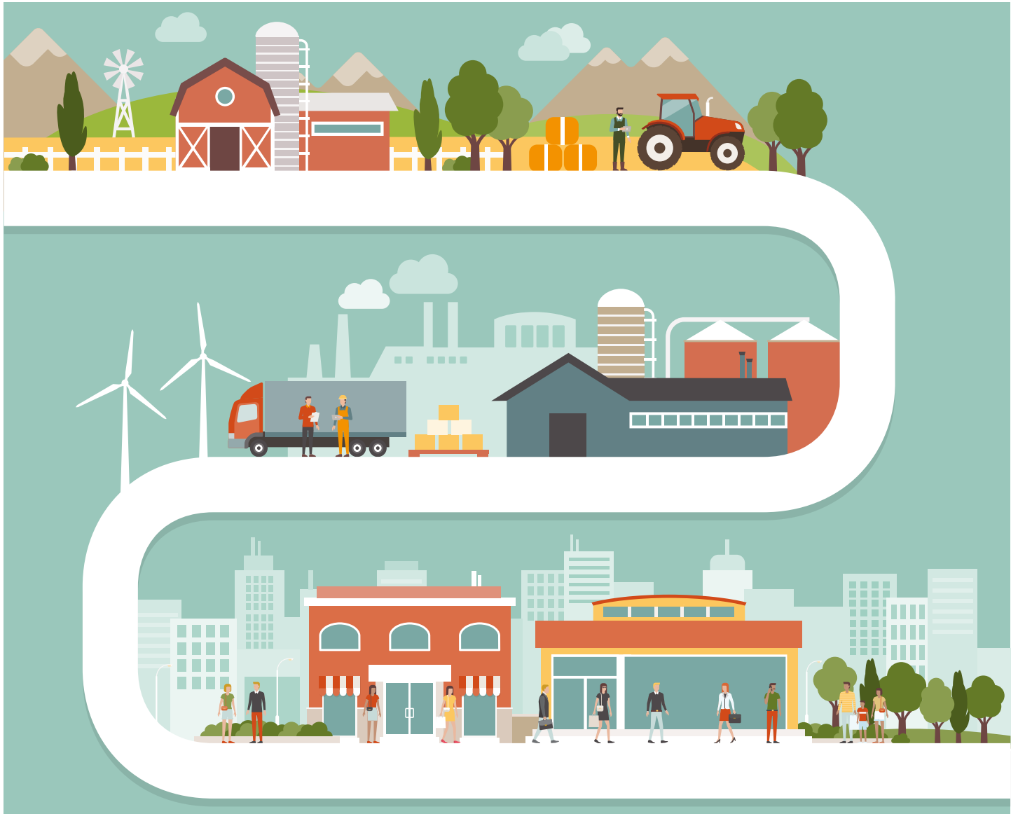
Figure 1. Indicative agricultural food supply chain 5

This section identifies industry specific hazards and risks in the agricultural and horticultural supply chain and suggested controls identified by industry participants. The focus of this Code is on the Primary Producer to Processor transport activities and business practices – see Figure 1.