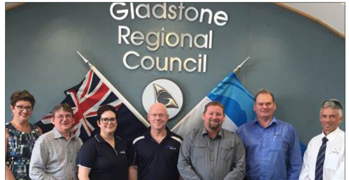
Qld Transport and Main Roads, LGAQ, the NHVR and Gladstone Regional Council at the Gladstone Regional Roads and Transport Meeting earlier this month.

Following on from the initial Road Manager Workshops held in South Australia in October, discussions are underway to schedule a series of Route Assessment training sessions for local governments in early 2017.