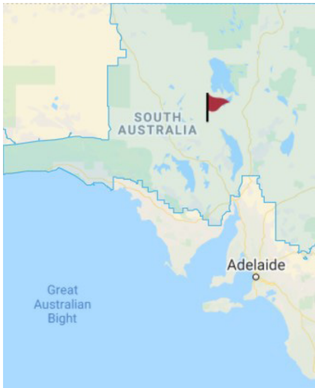
Figure 1: Pastoral Unincorporated Areas