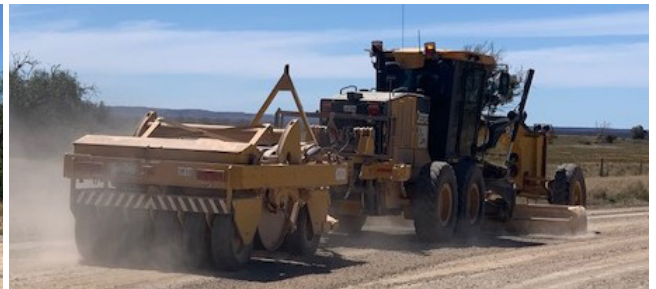
Figures 4 and 5: Motor grader towing one trailer or vehicle (maximum combination length 19m)