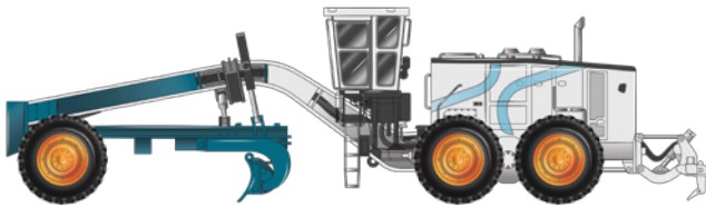
Figure 3: Motor grader (maximum vehicle length 12.5m)

The following are examples of vehicles and combinations eligible to operate under the Notice.