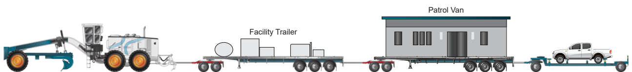
Figure 7: Motor grader towing multiple trailers or vehicles (maximum combination length 53.5m)